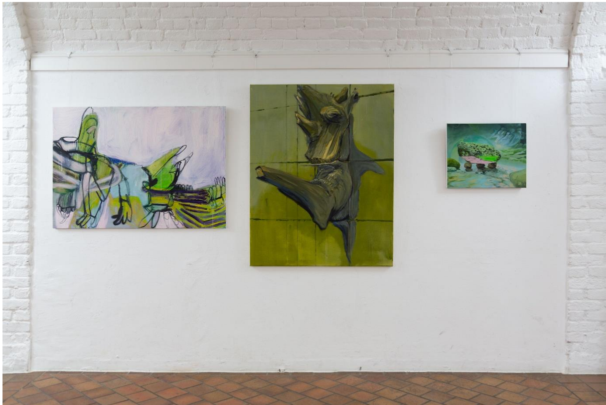
Install shot of Nadja Gabriela Plein: 'die Verknüpfung knackt und schlängelt/ The linking cracks and slithers', Rhys Trussler: 'Happy Homunculus', and Benjamin Deakin: 'Migrator'

To be subsumed is to include or absorb something into something else. From each microscopic particle of pigment, to each brushstroke, each painting and what they represent in isolation and as a collection, the place of the gallery space within the church, in London, on this Earth, and even the Universe beyond, "Subsumed: Absorbing Surfaces" hopes that each of these paintings could provide a starting point for an imaginative journey of our own personal sense of scale, place and power within the spaces we inhabit.