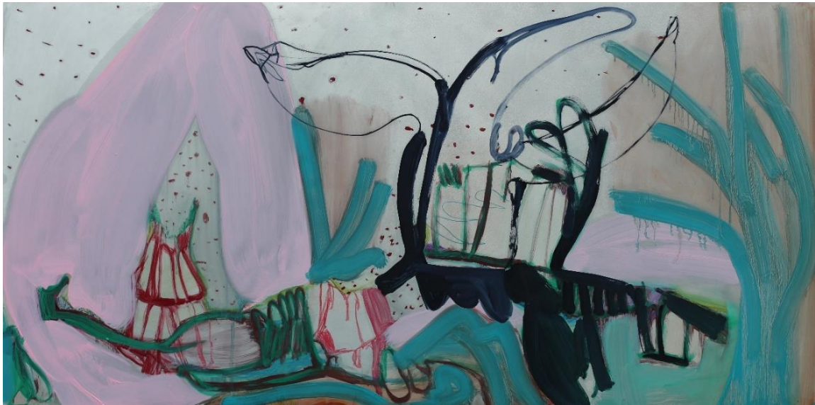
Nadja Gabriela Plein: 'die Strömung der Lautfreude/ The stream of loud-joy' 50 x 100cm oil on aluminium, 2018

Plein’s art practice and indeed entire life is an interaction with the materiality around her, being a body in a place and being a body in contact with other materials and other bodies. It is all so interwoven and non-hierarchical, it is impossible to say what has subsumed what. To Plein, the painting process and object holds the same preciousness as the step on the grass.