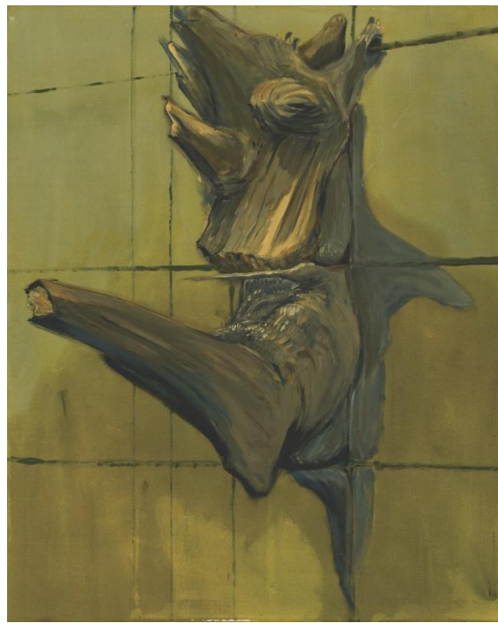
Rhys Trussler: 'Happy Homunculus' 122 x 96cm, oil and acrylic on canvas, 2017

Trussler's subjects are frequently drawn from observation and animated or anthropomorphised through exaggeration to develop a sense of character. His primary concern is seated in a deep sense of 'otherness' or peculiarity as a lens through which the world is observed.