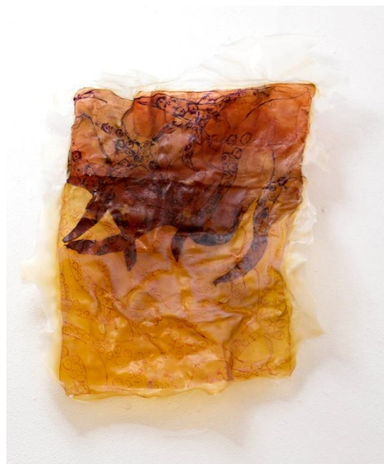
Fiona Long: 'Sublimation' 50 x 40cm, tattooed biofilm in seaweed bioplastic, 2018

Long's practice explores consumption, desire and sustainability. The octopus motif combines these themes and was inspired, in part, by the tradition of the subject from Hokusai to Picasso. 5