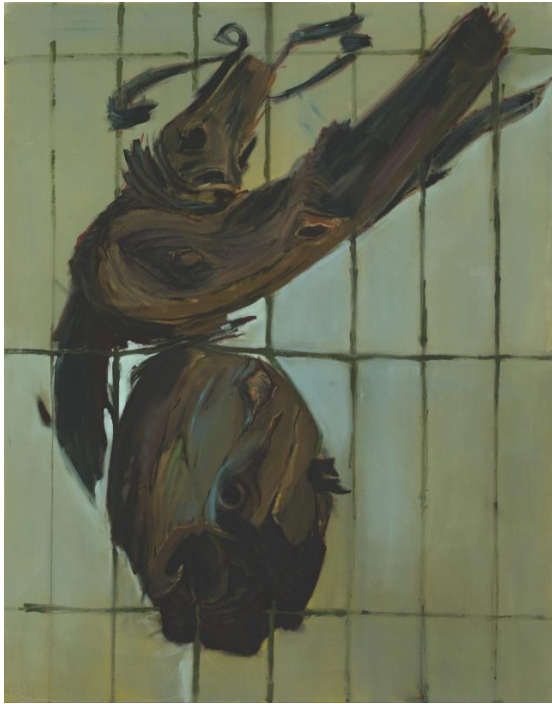
Rhys Trussler: 'Shady Bruiser' 122 x 96cm, oil and acrylic on canvas, 2017