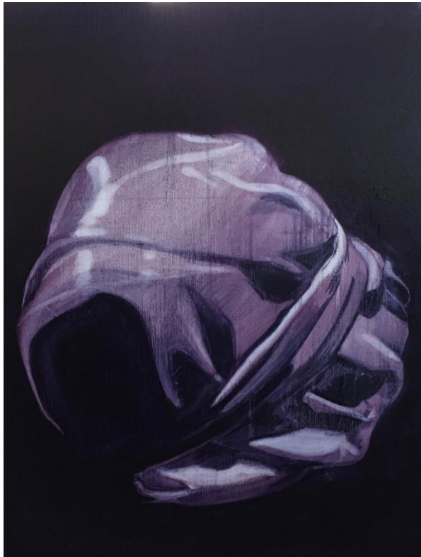
Paula MacArthur: 'I will take care of you' 80 x 50cm, oil on linen, 2017

Through this dissection the objects they become recognisable yet unfamiliar; the viewer can't be certain of what they are looking at. Coupled with the dripping paint these strange and beautiful objects conjure ephemerality, deterioration, and the fragility of the human condition.