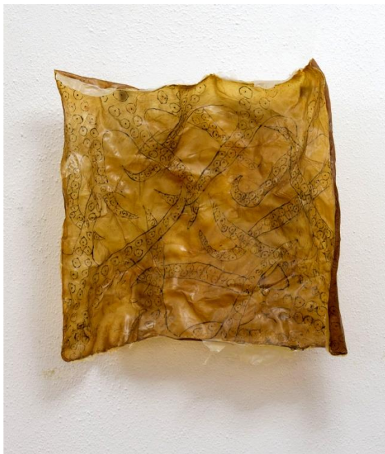
Fiona Long: 'Reverse Sublimation' 50 x 40x10cm, tattooed biofilm with squid ink in seaweed bioplastic, 2018

In both of Long's paintings, the tattooed image depicts a writhing mass of octopus tentacles. Whilst the image is trapped within the surface, it illustrates cephalopod creatures whose unfurled limbs are poised to suck onto their imminent prey and pull them in to digest, absorb, and assimilate.