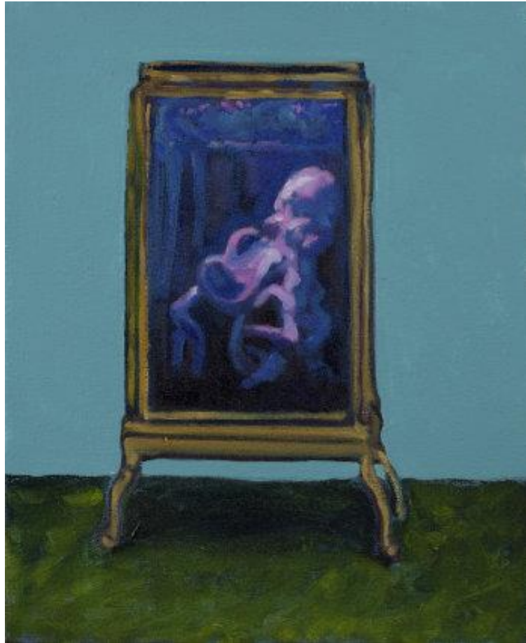
David Sullivan: 'Brave [the] New World' 30 x 25cm, oil on canvas, 2016

In Sullivan's 'Brave [the] New World' another cephalopod appears. This time the tentacular creature doesn't threaten to subsume and consume the viewer but is contained within its own vitrinous jail, and in turn the edges of the depicted surrounding space to the edges of the canvas.