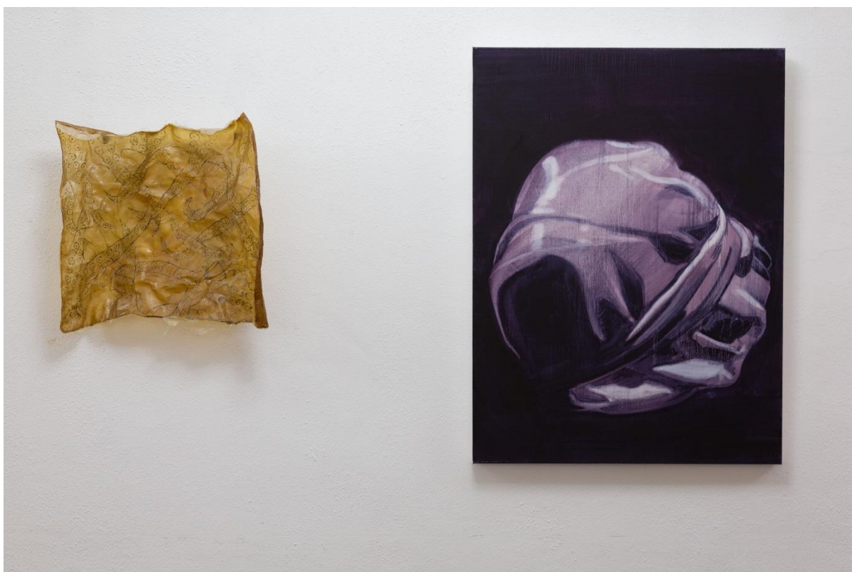
Install shot of Fiona Long’s “Reverse Sublimation” and Paula MacArthur’s “I will take care of you”

Depicted below, Long’s and MacArthur’s artworks, displayed side by side in the exhibition, have an interesting interplay. Whilst Long’s have a fabric-like quality to them, MacArthur’s depict a representation of fabric. Pale amber neighbours complementary deep purple. Bent form plays against the illustration of form, and translucent material juxtaposes the depiction of fabric where the translucency of the paint gives the subject a sense of solidity. And where Long’s subject threatens to subsume the viewer, MacArthur’s subject appears to be subsumed within the space of the painting and, in a sense, within the paint itself.