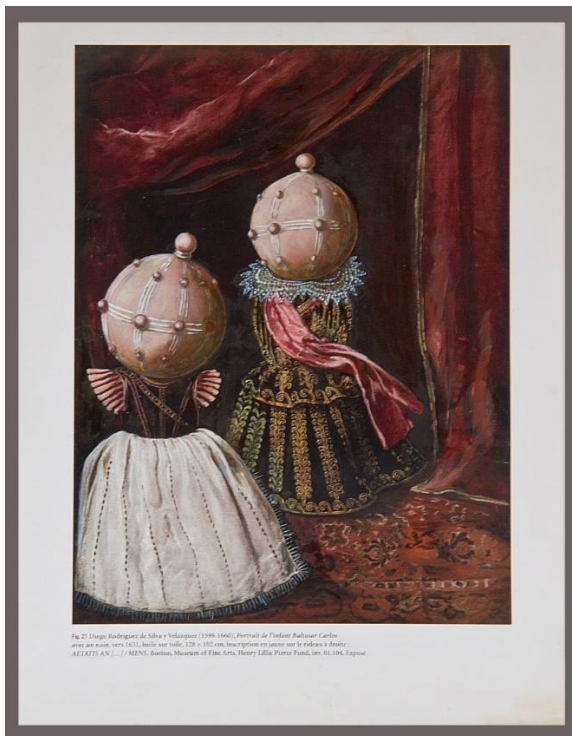
Sasha Bowles: 'Twin Orbs' 35 x 40cm, oil on book page, 2016

"...The artist as collaborator, working in alliance with the past. Sasha's role in the work is similar to that of a ventriloquist or dramatist - unobtrusive but influential. The apparent absence or anonymity is carefully contrived and multilayered. What is erased from, or added to these images is invariably self evident, but the ramifications of these interventions are significant. Our expectations are frustrated and our understanding contested but like disturbing images in general, it's often difficult to look away and even more difficult to ignore." (Graham Crowley 2017)