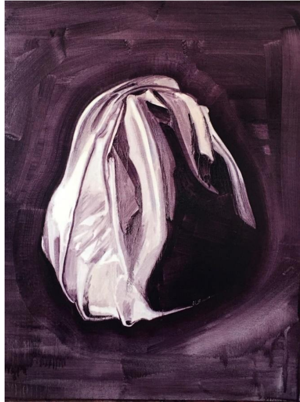
Paula MacArthur: 'Just how I feel' 80x 50cm, oil on linen, 2017

One could imagine human figures wrapped inside these depictions of bundled cloth. The body subsumed by the fabric.