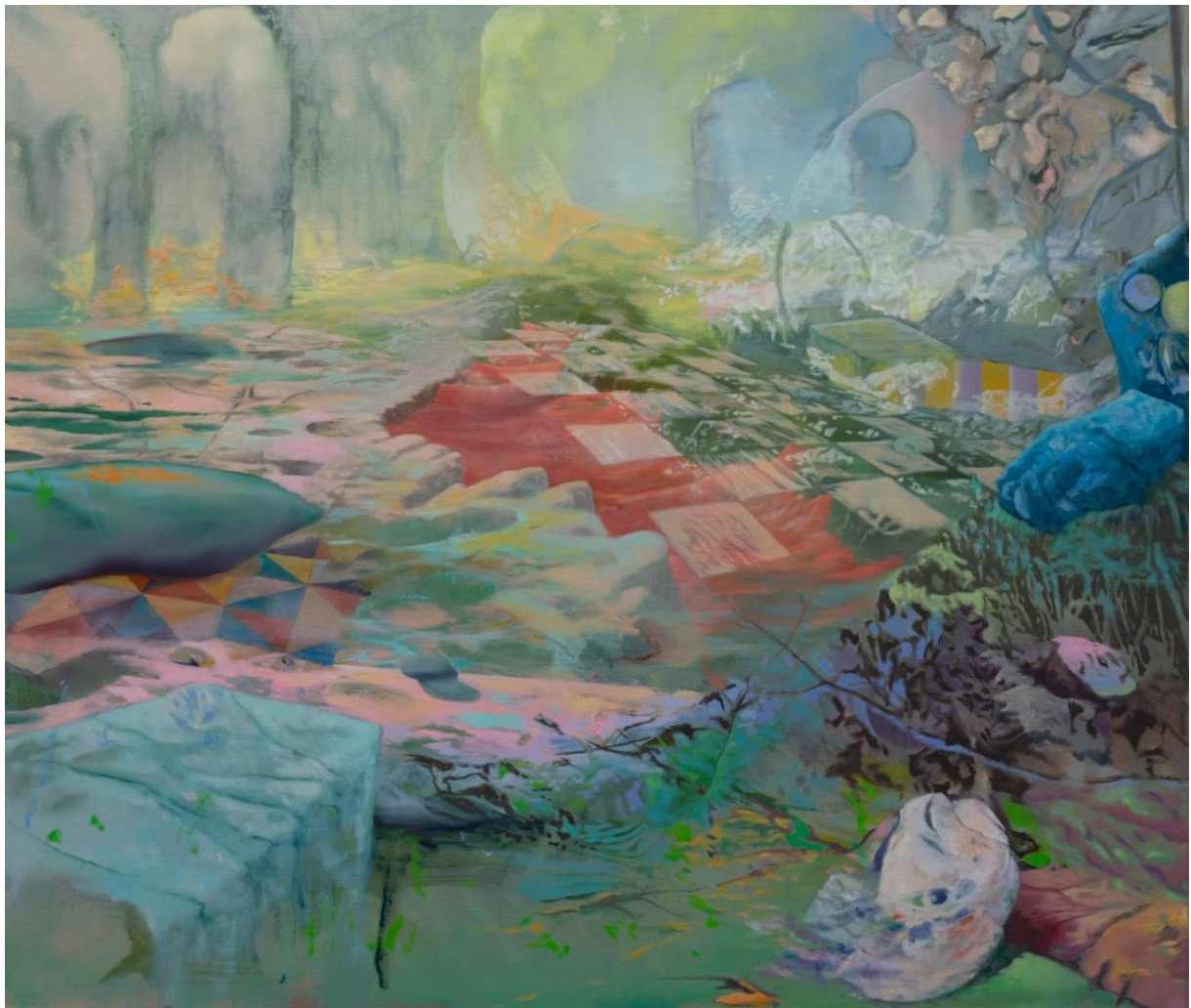
Benjamin Deakin: 'Arbiter' 90 x 105cm, oil on Linen, 2018

Benjamin Deakin's prevailing interest is the way in which landscape painting can be used to explore our physical and cultural relationships with the environment, both human and non-human. From the time that images of the landscape first began to be made, they have critiqued and questioned our perception of the world around us and what distinguishes the natural from the man-made. Whilst the version of the world our minds create for us is essential to our survival, Deakin believes that art can reveal ways in which we can disrupt these visual filters and lead us to a deeper understanding of how we function in and contribute to the natural systems of the world around us. The viewer may imagine themselves stepping into the scene and exploring, subsumed by the dreamlike, uncanny landscape.