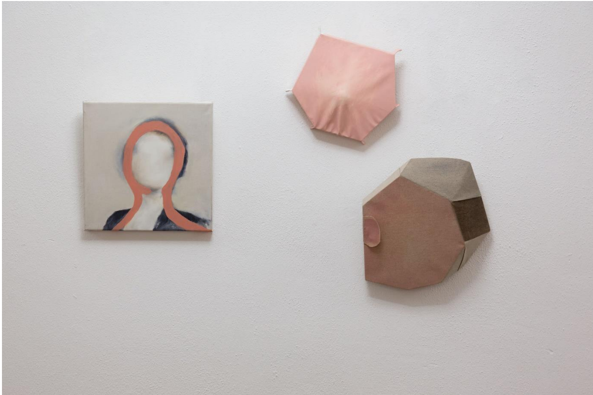
Installation shot of Wendy Saunders (left to right): 'Impossible Woman' 30 x 30cm, oil on linen, 2016, 'Abstracted Head (series 2)' 26 x 23 x 6cm, mixed media on linen, 2018, & 'Untitled Head (in four colours)' 30 x 29 x 10cm, oil on linen, 2018

Presented here as a clustered trio, (a unique snapshot of her evolving practice comprising older and very new works) each abstracted individual is subsumed into the grouping, and their features subsumed by Saunders' evolved, abstracted representation of the human form; but are they portraits? Using a combination of surface and materials she attempts to evoke visual ideas of character, states of emotion or some form of human expression.