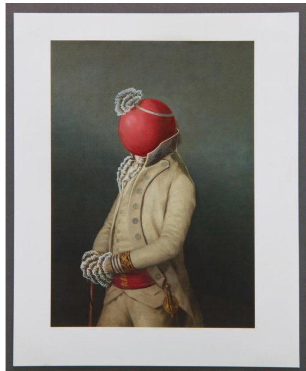
Sasha Bowles: 'Dandy Titfer' 35 x 40cm, oil on book page, 2016

In "Twin Orbs" not only has Bowles subsumed the identity of these figures, these girls also look poised to become absorbed by the soft red fabric cavern they inhabit.