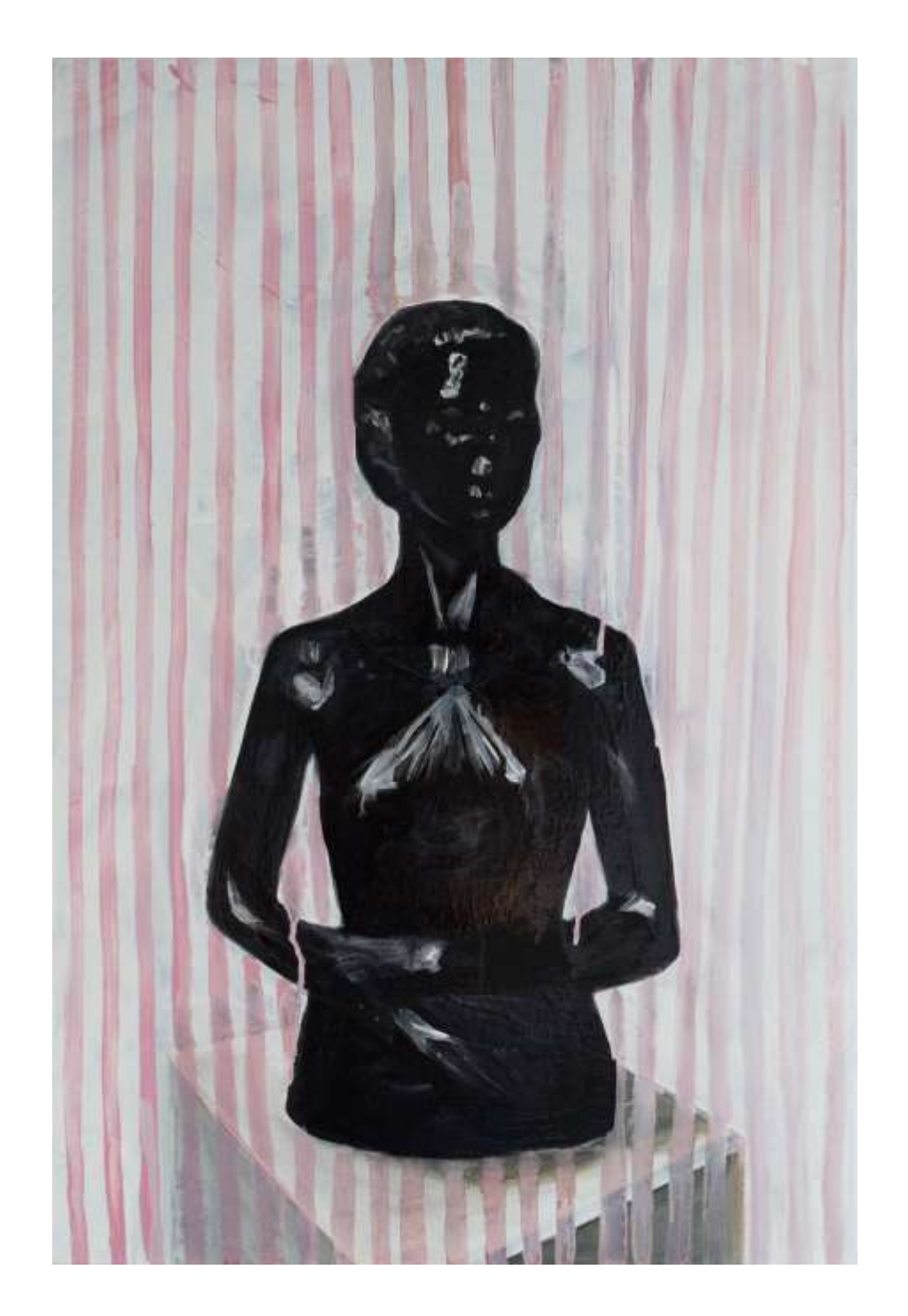
Black Venus 60 x 40 cm, Oil on canvas, 2014-15