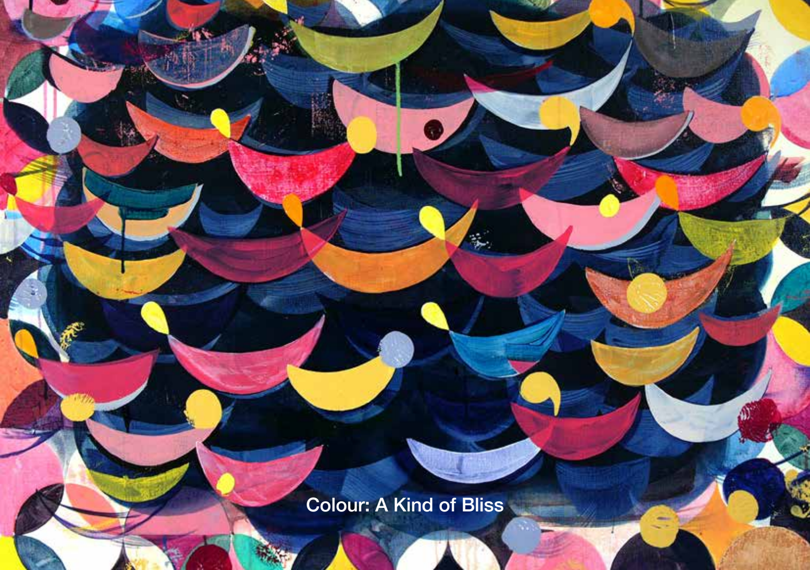
Colour: A Kind of Bliss