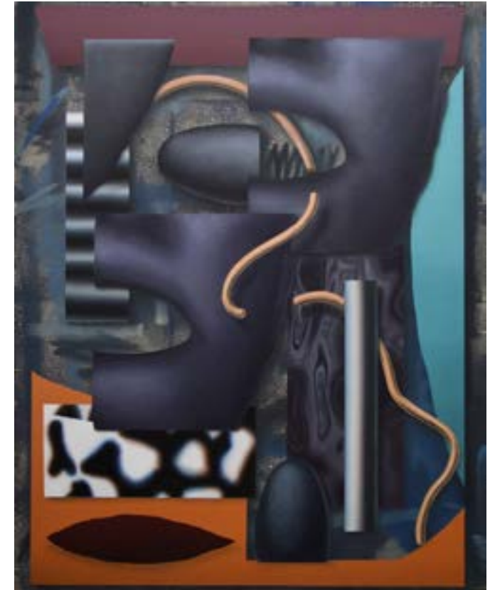
Procession (2016) Oil and acrylic on canvas 50cm x 60cm