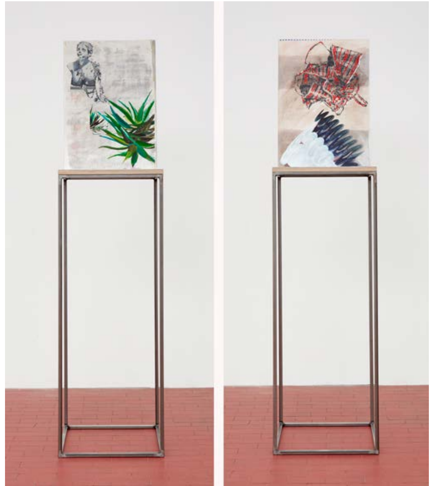
Parallel Culture (2016) Oil paint, spray paint, oil pastel, silver leaf on pigmented gesso panel and steel structure 182cm x 45cm x 45cm