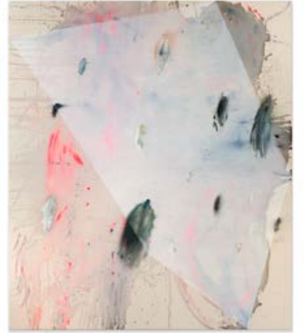
Plume (2014) Oil, acrylic and paint pen on canvas 153cm x 178cm