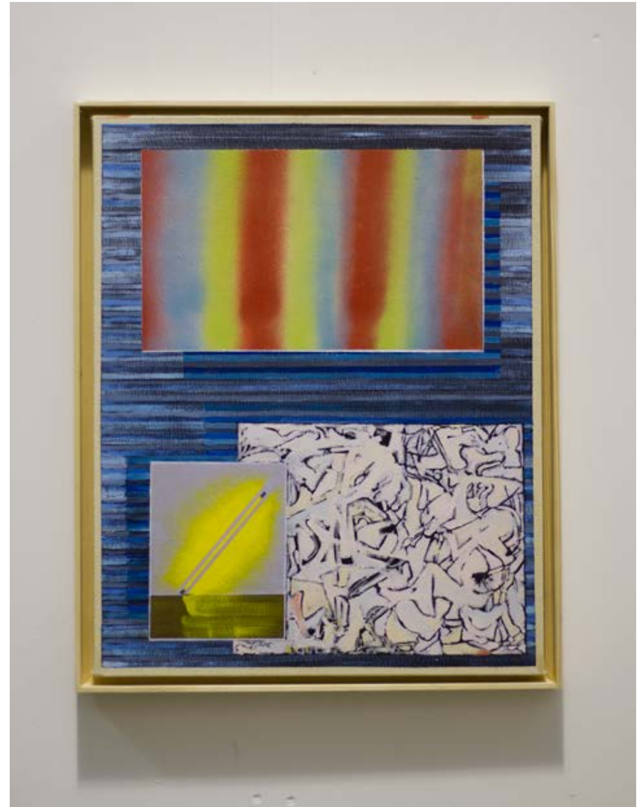
Competitors Ready (2016) Oil and enamel on canvas 50cm x 40cm