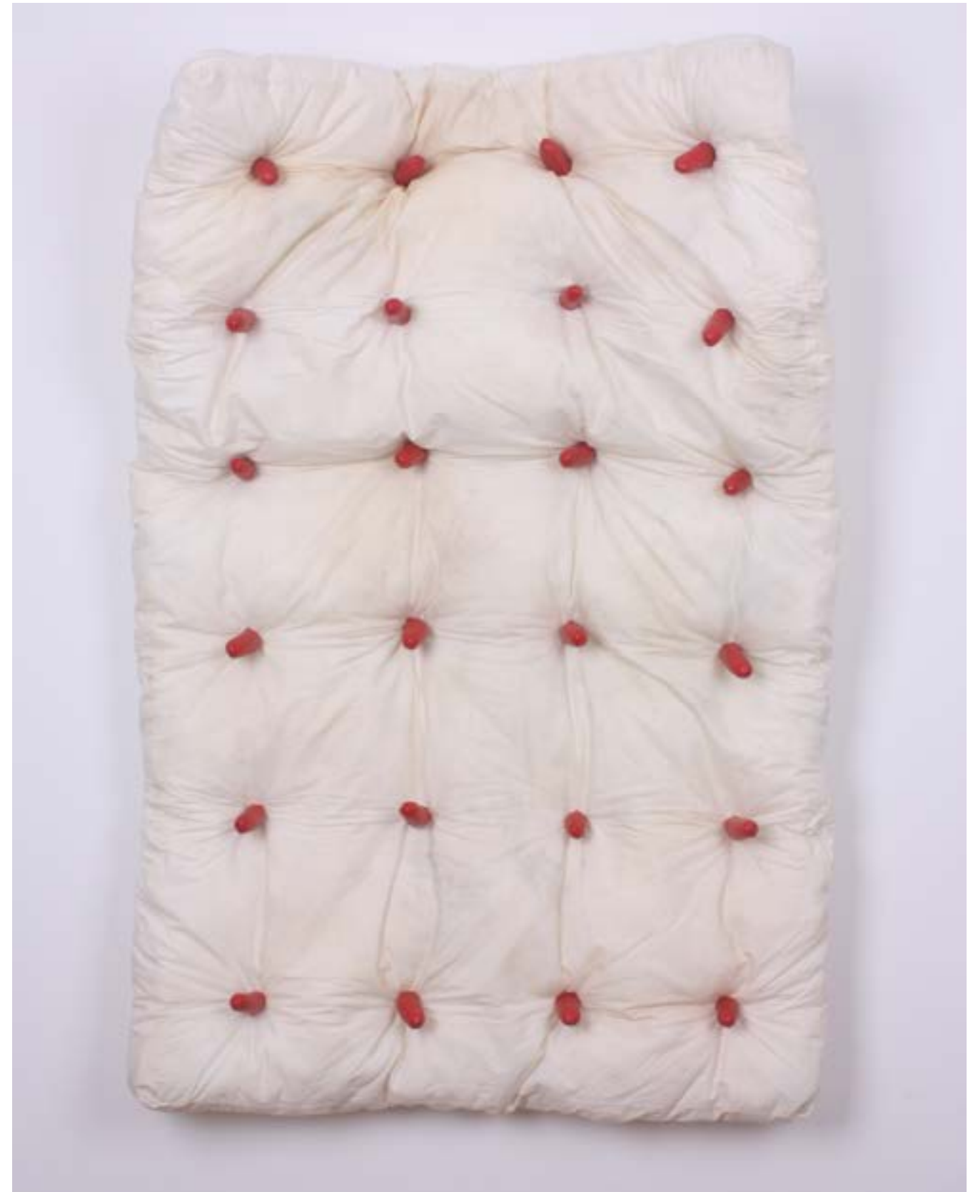
Jesus Toast (2011) Calico, acrylic paints, wadding, PVC, plywood 86cm x 136cm