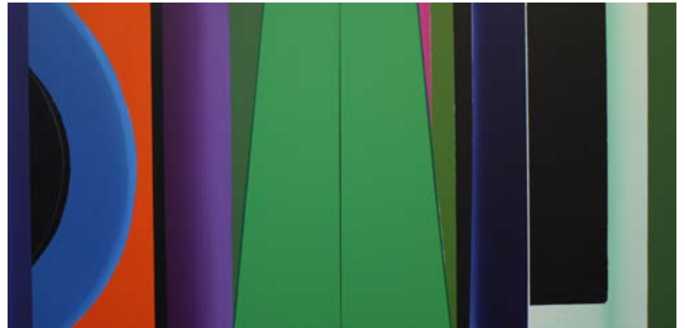
Soft green filtered violet (2016) Acrylic on canvas 153cm x 76 cm