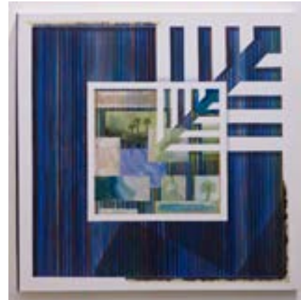
Plonked (2016) Oil on canvas 120cm x 120cm