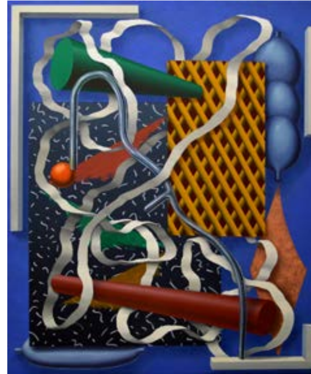
In Chorus (2016) Oil and acrylic on canvas over panel 61cm x 76.5cm